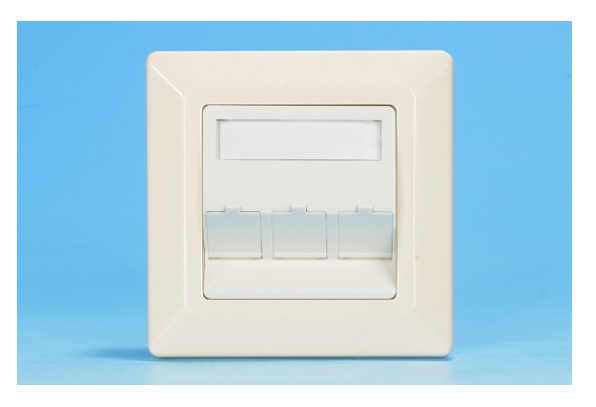
NMC-PL80x80-3PA-WT for 3 ports