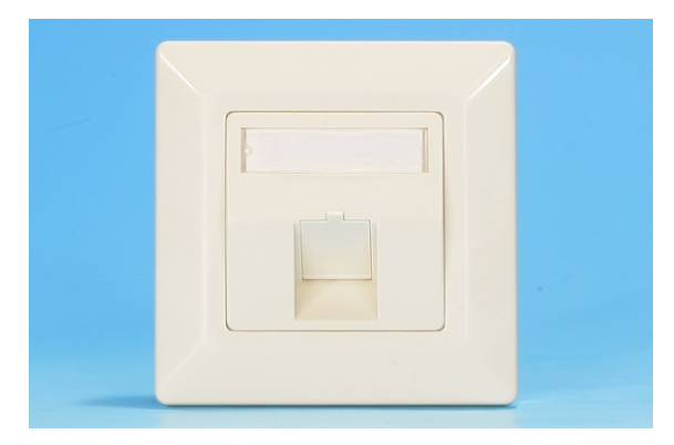
NMC-PL80x80-1PA-WT for 1 ports

NMC-PL80x80-1PA-WT - NIKOMAX wall-mounted socket 1 port, for Keystone insert modules, white. NMC-PL80x80-2PA-WT - NIKOMAX wall-mounted socket 2 port, for Keystone insert modules, white. NMC-PL80x80-3PA-WT - NIKOMAX wall-mounted socket 3 port, for Keystone insert modules, white.