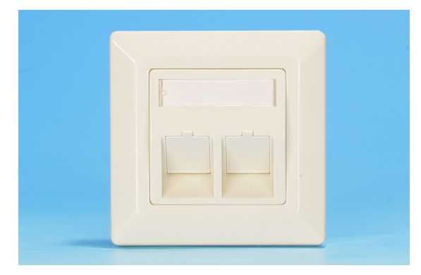
NMC-PL80x80-2PA-WT for 2 ports