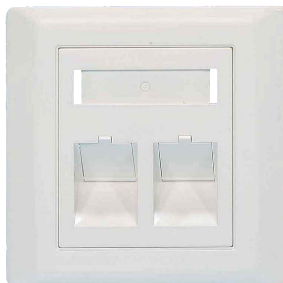
NMC-FP86X86-2PA-WT for 2 ports