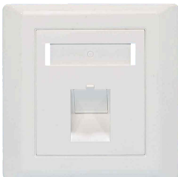
NMC-FP86X86-1PA-WT for 1 port

NIKOMAX Angled Faceplate, has dust cover and angled design applied in work area with standard size 86x86 and compatible with full series NIKOMAX keystone jacks.