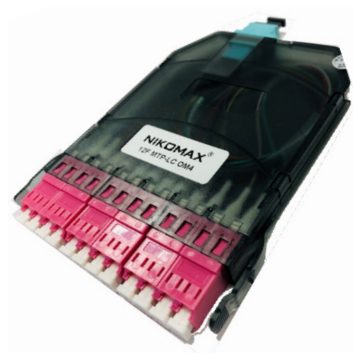
NMF-CJ12M4PA-MTPM-LCU-TR 12 ports LC / UPC, MM 50/125, OM4