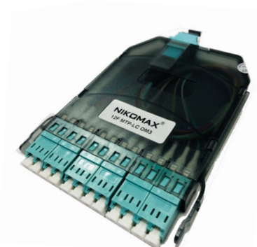
NMF-CJ12M3PA-MTPM-LCU-TR 12 ports LC / UPC, SM 9/125, OS2