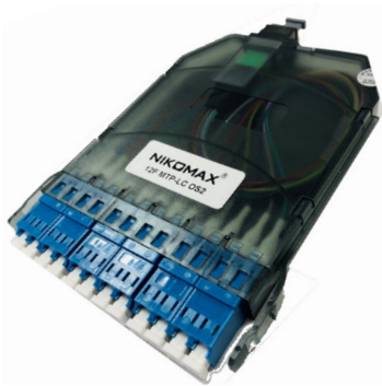
NMF-CJ12S2PA-MTPM-LCU-TR 12 ports LC / UPC, SM 9/125, OS2