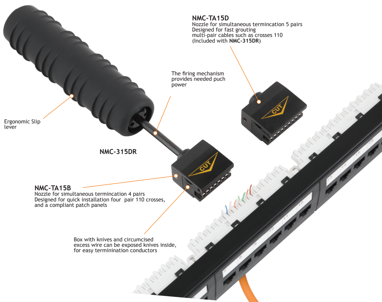
Table of compatible components - Patch Panels

NMC-315DR is packed with 5 pairs intended for terminating multi-pair cables in the 110 type terminal blocks. To seal four pair is more convenient to use with NMC-TA15B nozzle (sold separately). This piece does not crashed into neighboring IDC contacts, help extending their lives, which is especially important for patch panels.